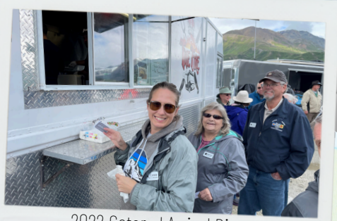
2022 Catered Arrival Dinner - The Fire Food Truck out of Delta Junction