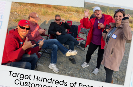
Target Hundreds of Potential Customers in one place!