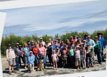
2023 GROUP HIKE TO THE TOLSONA MUD VOLCANO