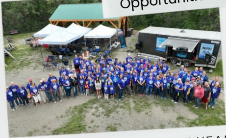
100-150 ATTENDEES EACH YEAR 2023 GROUP PHOTO