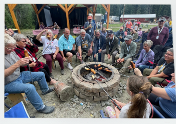
Famous Waddinger Night