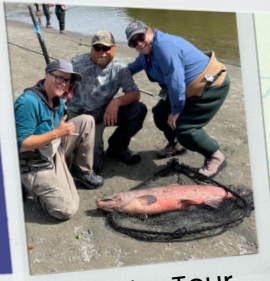
Off-Site Tour Opportunities