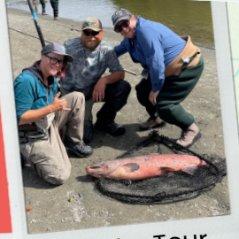
Off-Site Tour Opportunities