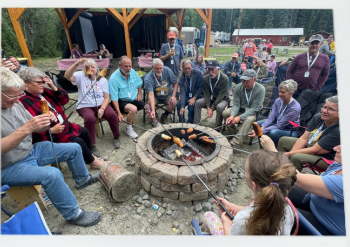
Famous Waddinger Night