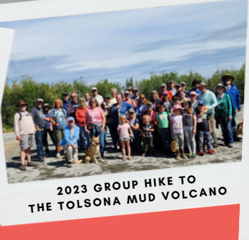
2023 GROUP HIKE TO THE TOLSONA MUD VOLCANO