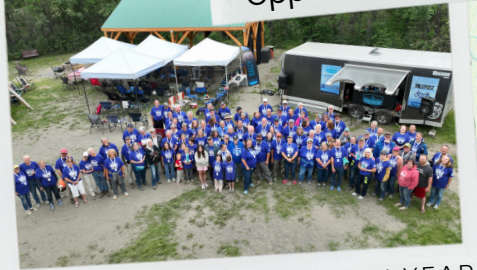
100-150 ATTENDEES EACH YEAR 2023 GROUP PHOTO